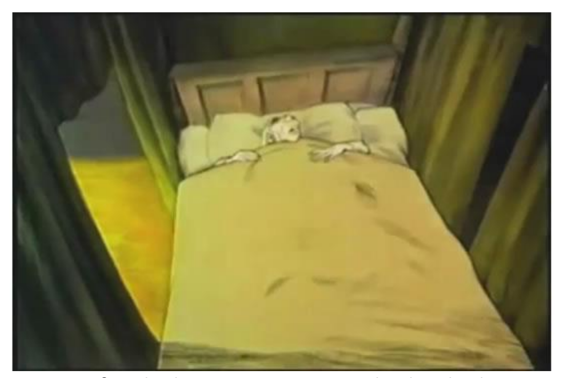
Before he knew it Scrooge was back in bed.